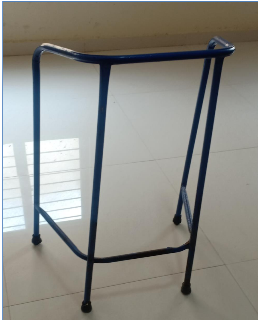
Walker facility at MRCE

Approved by AICTE - New Delhi, Affiliated to JNTU - Hyderabad, Accredited by NBA & Accredited by NAAC. ISO 9001:2015 Certified Institution, Recognition of College under Section 2(f) & 12 (B) of the UGC Act, 1956.