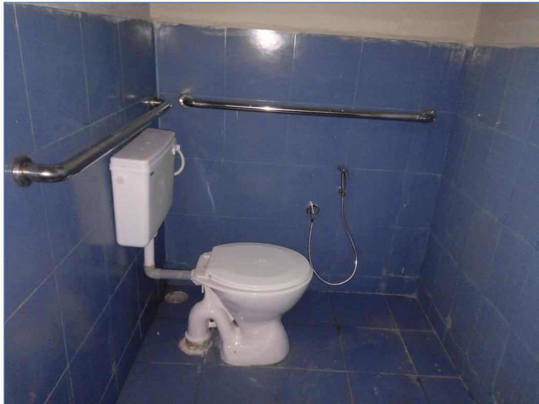
Toilets with hand rails

Approved by AICTE - New Delhi, Affiliated to JNTU - Hyderabad, Accredited by NBA & Accredited by NAAC. ISO 9001:2015 Certified Institution, Recognition of College under Section 2(f) & 12 (B) of the UGC Act, 1956.