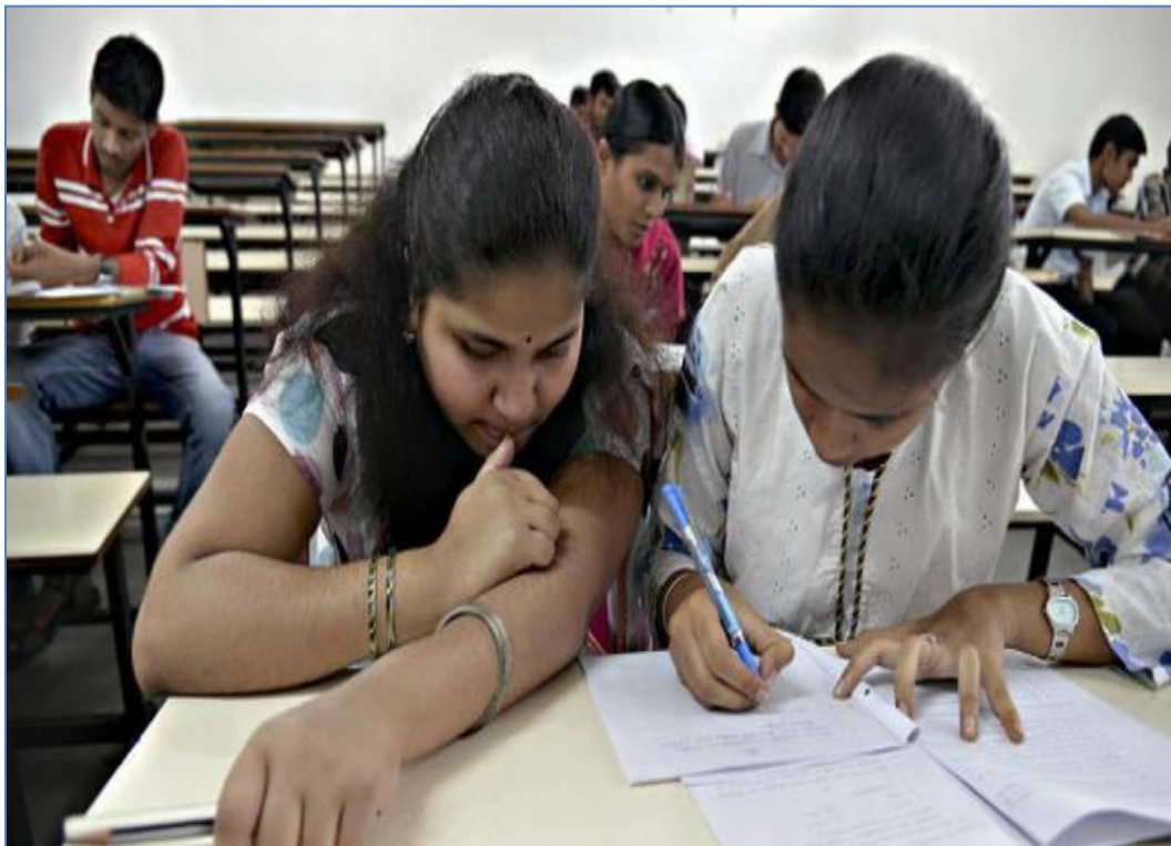
Scribes for examination

6) Scribes for examination :- . Scribes during exams are available on request (as per university regulations) and are made available as per the students request during exams. The scribes will write down exactly what the student dictates. A scribe will only record responses, including maps, graphs, or diagrams where appropriate, exactly as dictated by the student. A scribe may, however, use their discretion regarding spelling and punctuation.