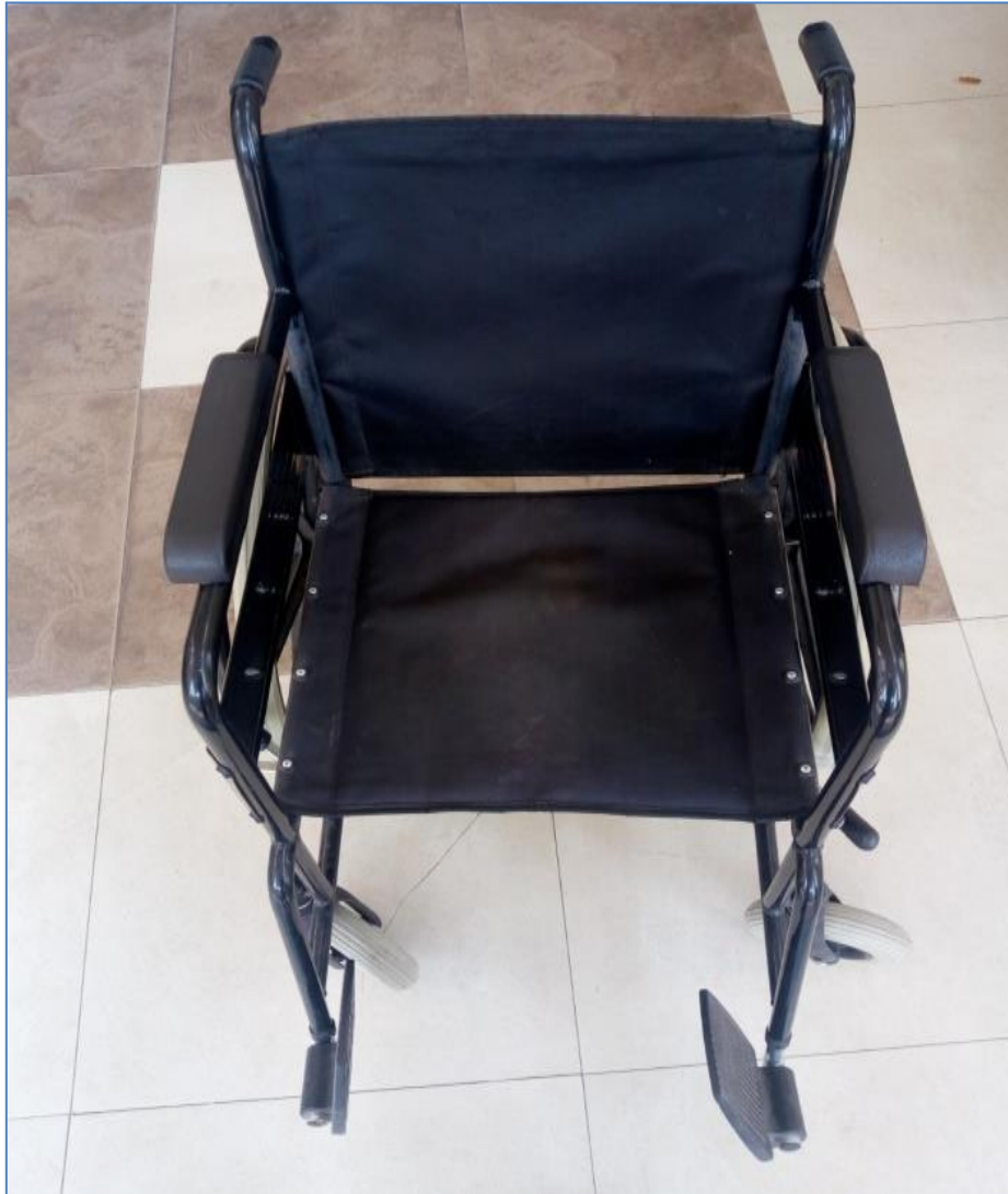
Wheelchair facility in MRCE

Approved by AICTE - New Delhi, Affiliated to JNTU - Hyderabad, Accredited by NBA & Accredited by NAAC. ISO 9001:2015 Certified Institution, Recognition of College under Section 2(f) & 12 (B) of the UGC Act, 1956.