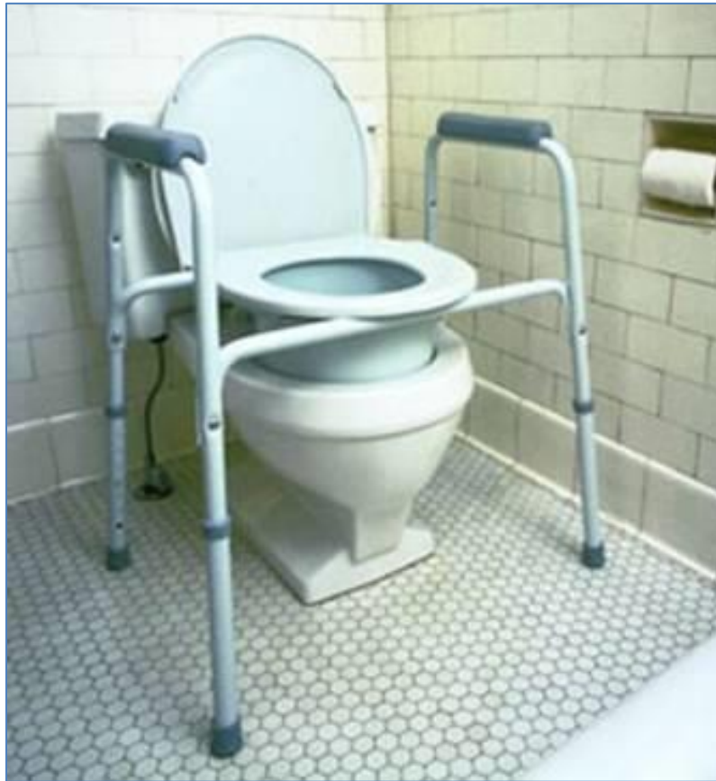
Toilets for physically disabled

5) Rest Rooms :- The college has wheelchair accessible toilets in each building with adequate space and also has hand rails. There are separate toilets for males and females (in each building). They have broad door and also have grab bars. Door width is suitable for wheel chair users in toilets. A wheel chair height toilet is provided to help the user on and off the toilet with handles (grab bars) and wheel chair height sink is provided for hand wash.